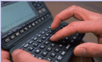
Computer Support = LQC Services